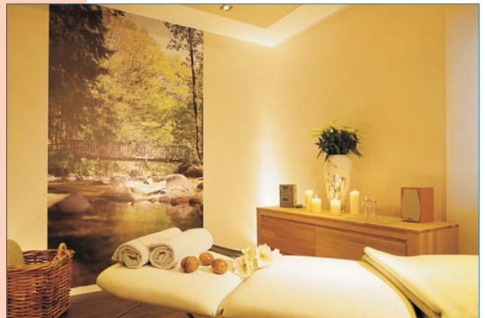
Massage room with ceiling heating

Project: Flair Hotel Nieder Place: Bestwig-Ostwig (Sauerland) Architect: Nils Oetterer, Werl Time: 2011 Use: Hotel/Wellness Area: 200 m 2 Type: Underfloor Heating, Ceiling Heating