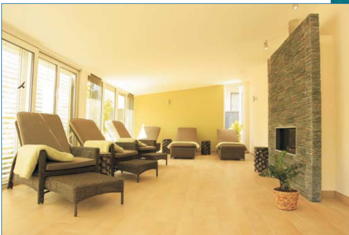
Relaxation room with underfloor heating

In order to amplify the services, Flair Hotel Nieder converted a neighbouring house into a spa area with sauna and massage rooms. Capillary tube mats as underfloor or ceiling heating provide pleasant, indirect warmth for the guests.